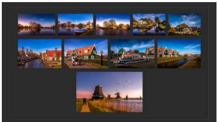
An example of EFIP/g Viewing plan