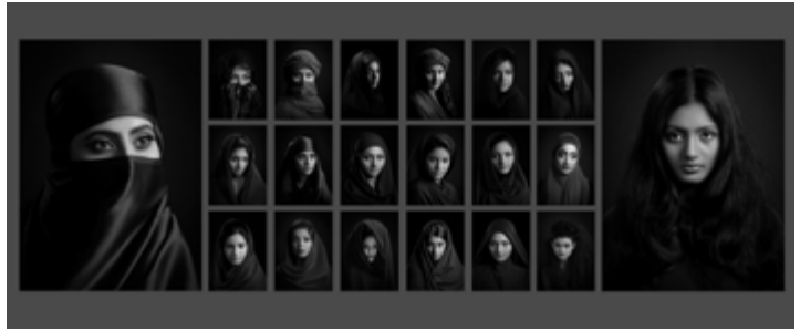
An example of MFIP Viewing plan

The application will be refused if the applicant's name, exif data, copyright symbol, logo, or any other identifying mark or the title of the Portfolio, title of the individual photograph is displayed on the Viewing Plan image.