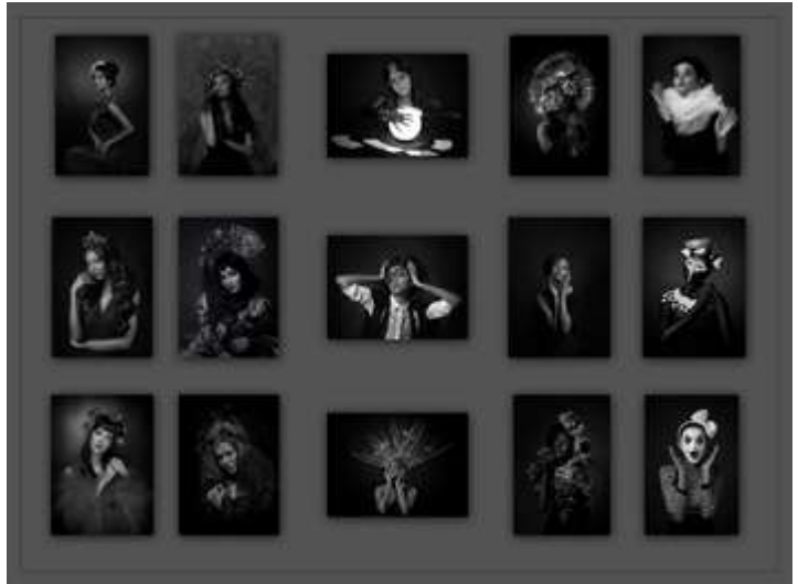
An example of EFIP/p Viewing plan